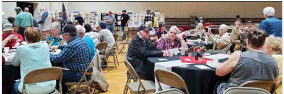
Members visiting during the 76th Annual Membership meeting.