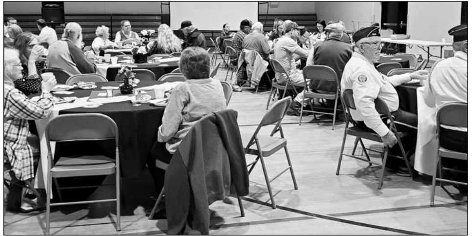
Members eating during the 76th Annual Membership meeting.