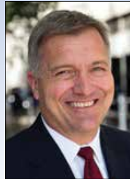
Jim Matheson, CEO NRECA

Driven by a focus on keeping the lights on, America's electric cooperatives have demonstrated what a responsible energy transition can look like. Electric co-ops low-