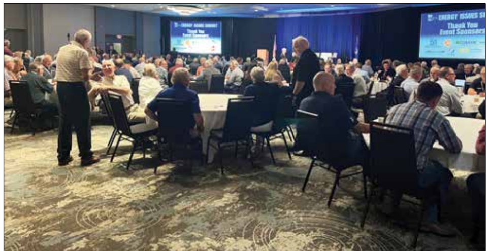
Energy issues Summit.